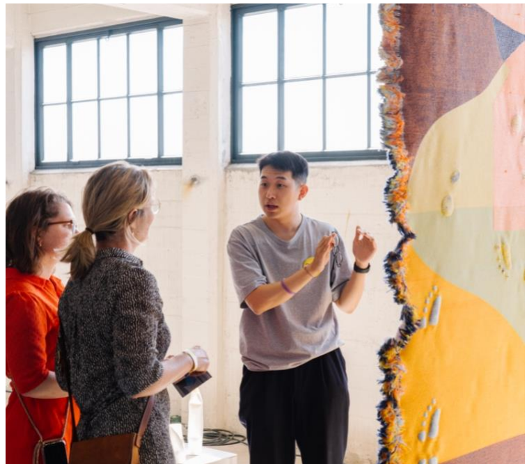
Left: lighting design by Atelier Artiforte, Right: textile design by Osangmin Studio