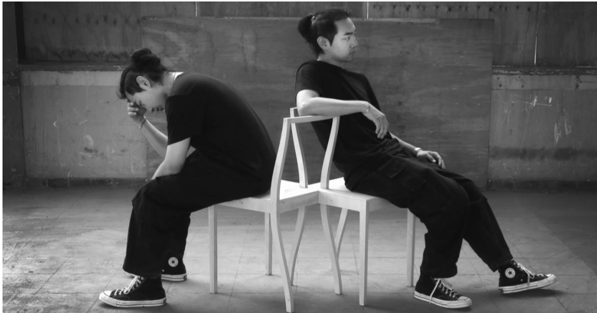
Furniture design by studiojbyji