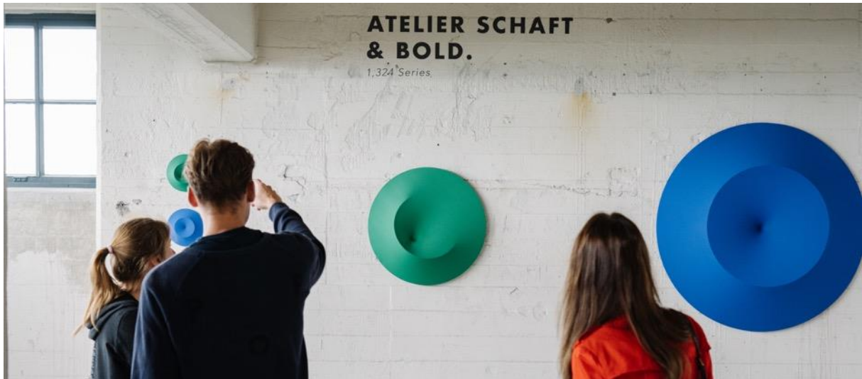
3Dimensional objects by Rotterdam based Atelier Schaft & Bold