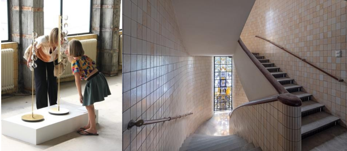
Left: work by Australian design duo Object Density. Right: Staircase in the monumental HAKA-building, photo Ossip van Duivenbode