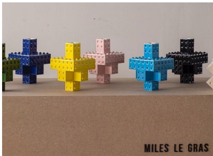
Left: upcoming talent Miles Le Gras. Right: interactive light installation by Aptum

Starting out as a small, traditional design fair more than ten years ago OBJECT transformed into a platform for contemporary design with a focus on new talent: "The Netherlands is fertile soil for promising designers, we give them a head start by offering them a platform right after graduation" says Van der Zwaag. Every edition, a large, fresh crop of designers participates for the first time. For a modest price, you can buy yourself a special piece of design and invest in what might become a household name. Recent graduates are placed right next to well-known labels; these unexpected combinations make the fair unique.