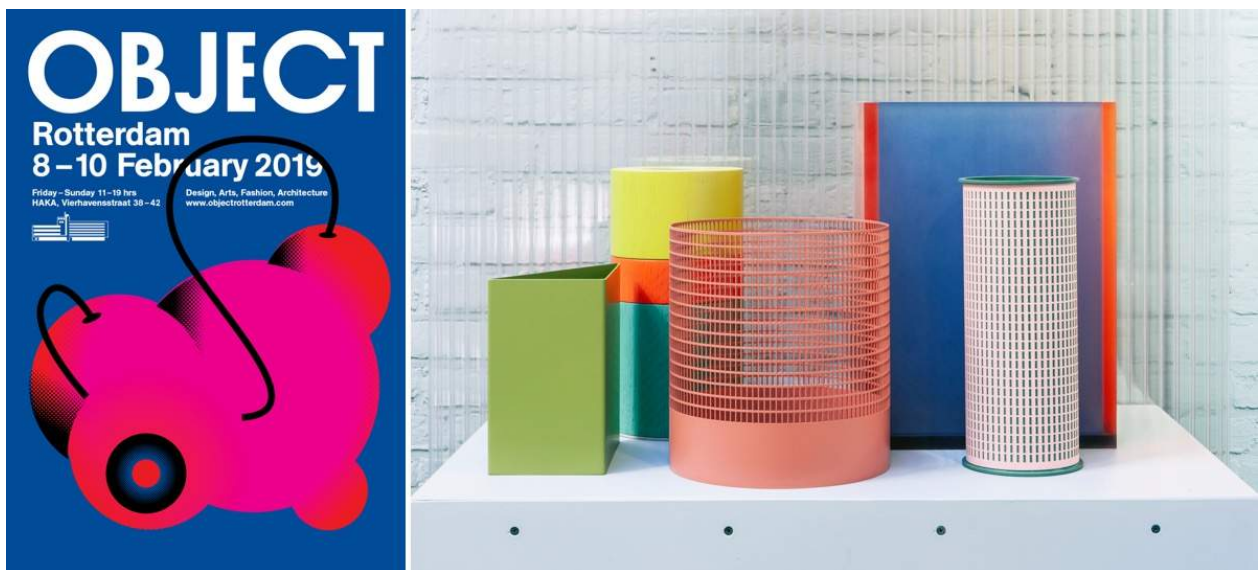
Left to right.: OBJECT Rotterdam 2019, Raw Color

For the second time the Rotterdam based design fair OBJECT Rotterdam takes place at the monumental HAKA-building. The upcoming edition, from Friday February 8 th until Sunday February 10 th , this impressive building will be completely filled with design. Visitors can even take a look and have a drink at the rooftop, with an amazing view over the city. More than a hundred well known and upcoming designers will be presenting limited edition furniture, interior and light objects, as well as jewellery, textile designs and large architectural installations. OBJECT Rotterdam has grown into a renowned interdisciplinary design platform.