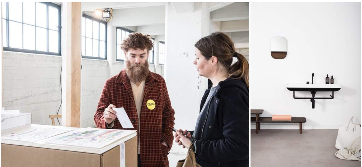
Left to right: visitors at OBJECT Rotterdam, Not Only White